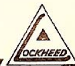
Figure SC VOLUME 2.