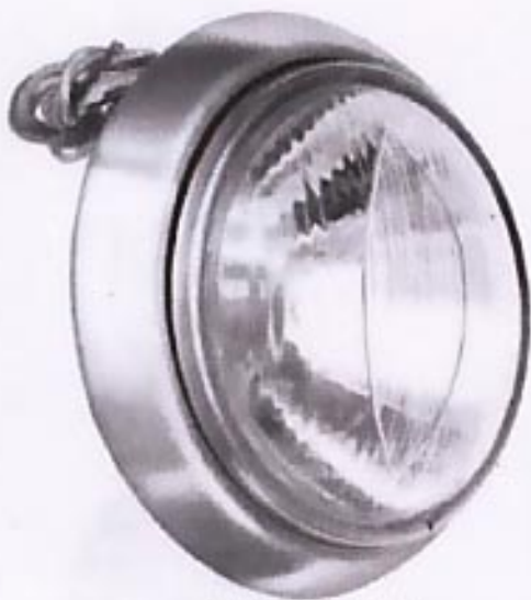
MODEL F575 MCF575 (less body)

F575, F700, P700, PF700, RF700, PF770, MCF575, RL700 and PL700