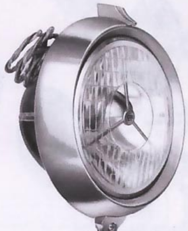
MODEL PF700 RF700