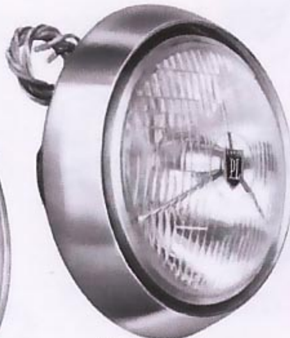
MODEL PL700 RL700 (R.R. Motif)