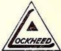
Figure BP VOLUME 2. Page 15